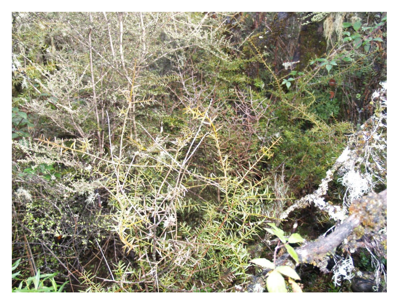
Figure 6: Totara seedling – a precursor of tall forest – developing under monoao scrub in frost flat heathland, Taparoa Clearing, Waipapa Ecological Area, Pureora Forest Park. March 2013.

Invasive weed species are more widespread in west Taupo heathlands (mean frequency of any species 65%) than on the Kaingaroa Plateau (42%). A wider range of species, 9 vs 4, is also present. The high weediness of Kuratau and Taparoa Clearings reflects their smaller size and proximity to roads and in the case of Kuratau, to pasture as well. Kuratau is also the closest site to the extensive heather population in and around Tongariro National Park. Pokaiora Clearing and Whenuakura Plain are larger and more remote.