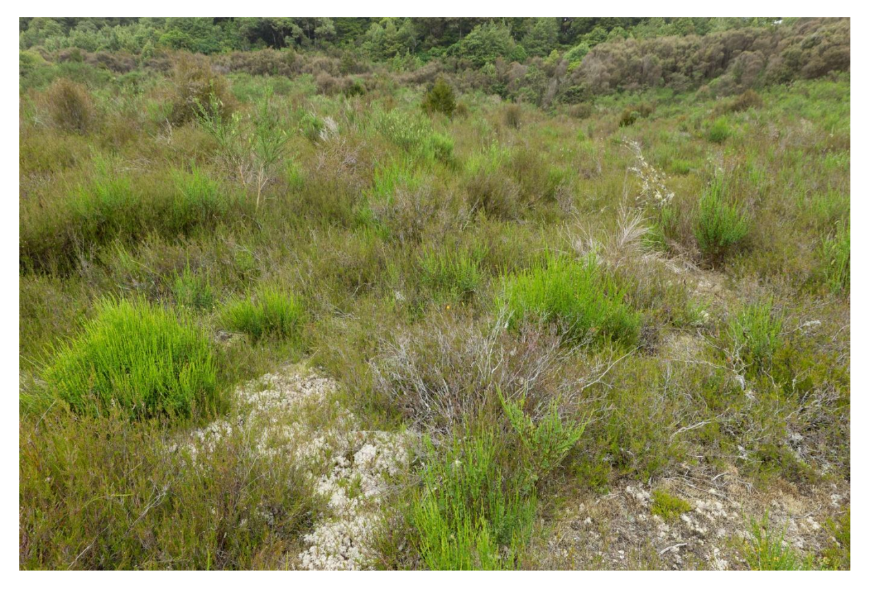
Figure 8: Frost flat heathland north of SH 41 in the Kuratau Clearing, Waituhi-Kuratau Scenic Reserve, greatly modified by weed – heather and broom – invasion. January 2014.

The low frequency of many diagnostic frost flat species and high frequency of forest precursor species highlight the fundamentally different nature of frost flat heathland at west Taupo (Waikato Region) and on the Kaingaroa Plateau (Bay of Plenty Region). Both regions have a long fire history, and other factors are likely to be responsible for the differences between them. The frost regime in the Taparoa Clearing is significantly milder than at Rangaitiki Conservation Area (Smale 1990). Information from the temperature loggers installed during this study across most of the frost flat spectrum in both regions will help clarify the contribution to differing vegetation pattern of this important limiting aspect of local climate. Soil fertility (not yet tested) may also be a contributing factor.