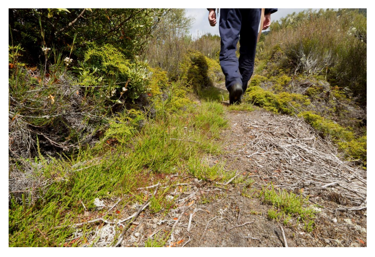
Figure 7: The invasive weed heather spreading on a foot track on the Whenuakura Plain, Pureora Forest Park. January 2013.

Both heather and broom are ruinous weeds in frost flat heathland. Heather is an ecological analogue of monoao and can almost completely oust it, as has already happened at Kuratau (Fig. 8). The recent introduction of biological control for heather elsewhere on the Volcanic Plateau may largely eliminate heather from Kuratau – where it is now beyond chemical or manual control – in the foreseeable future (Fig. 9).