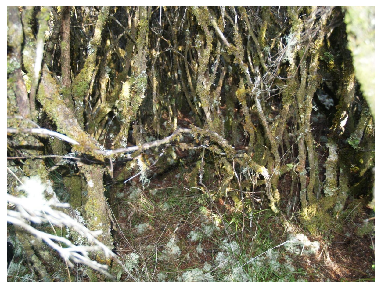
Figure 4: Understory of monoao scrub with coral lichen and Uncinia species in frost flat heathland in Taparoa Clearing, Waipapa Ecological Area, Pureora Forest Park. March 2013.