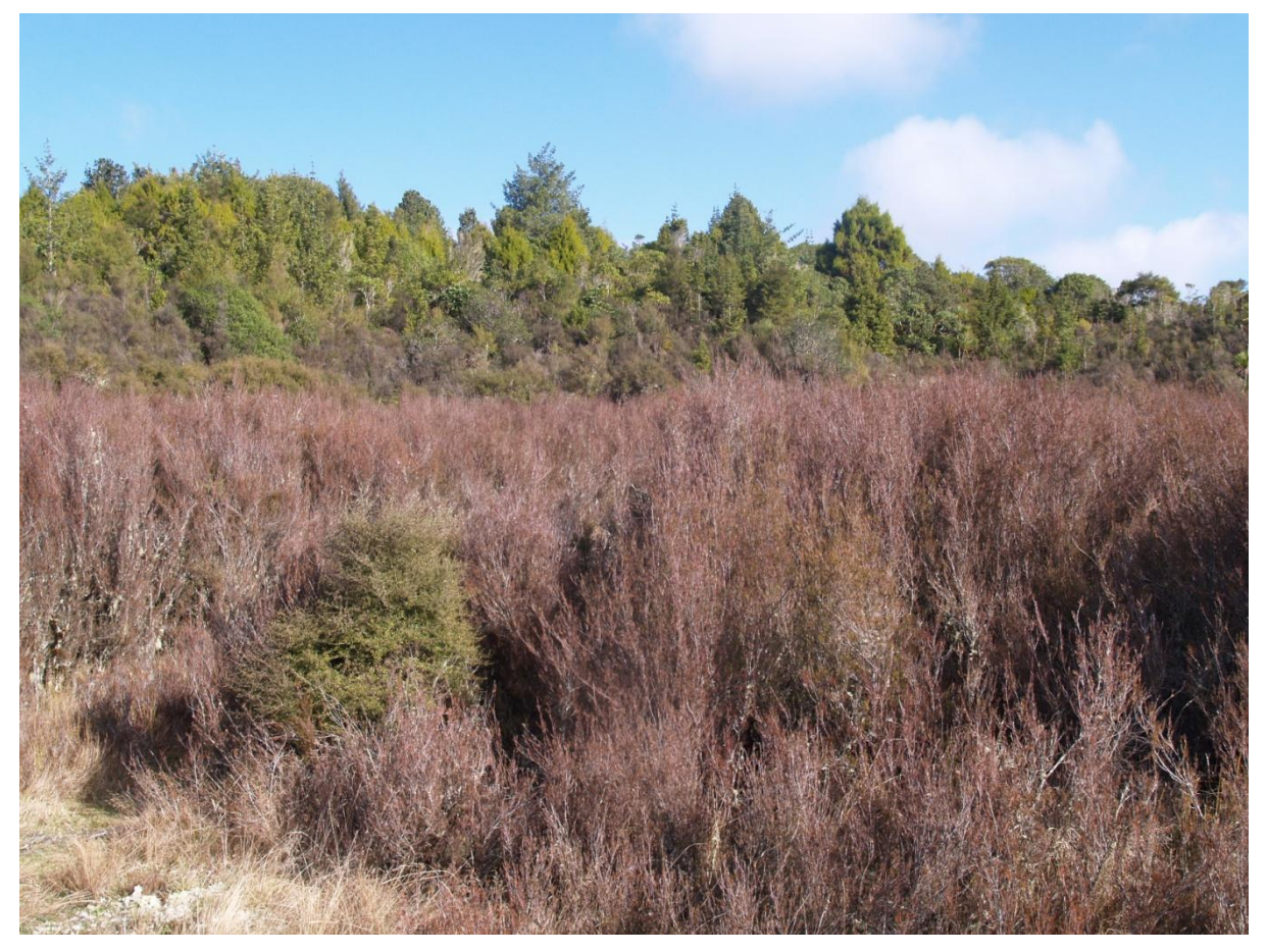
Figure 3: Monoao scrub in frost flat heathland in Taparoa Clearing, Waipapa Ecological Area, Pureora Forest Park. Manuka scrub and conifer forest on the hillslope behind. March 2013.

Appendix 4 describes data collection and further information as metadata.