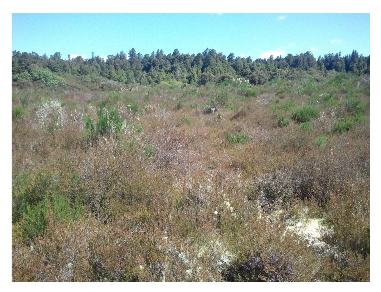
Figure 9: Frost flat heathland south of SH 41 in the Kuratau Clearing, Waituhi-Kuratau Scenic Reserve, greatly modified by weed – heather and broom – invasion. January 2014.