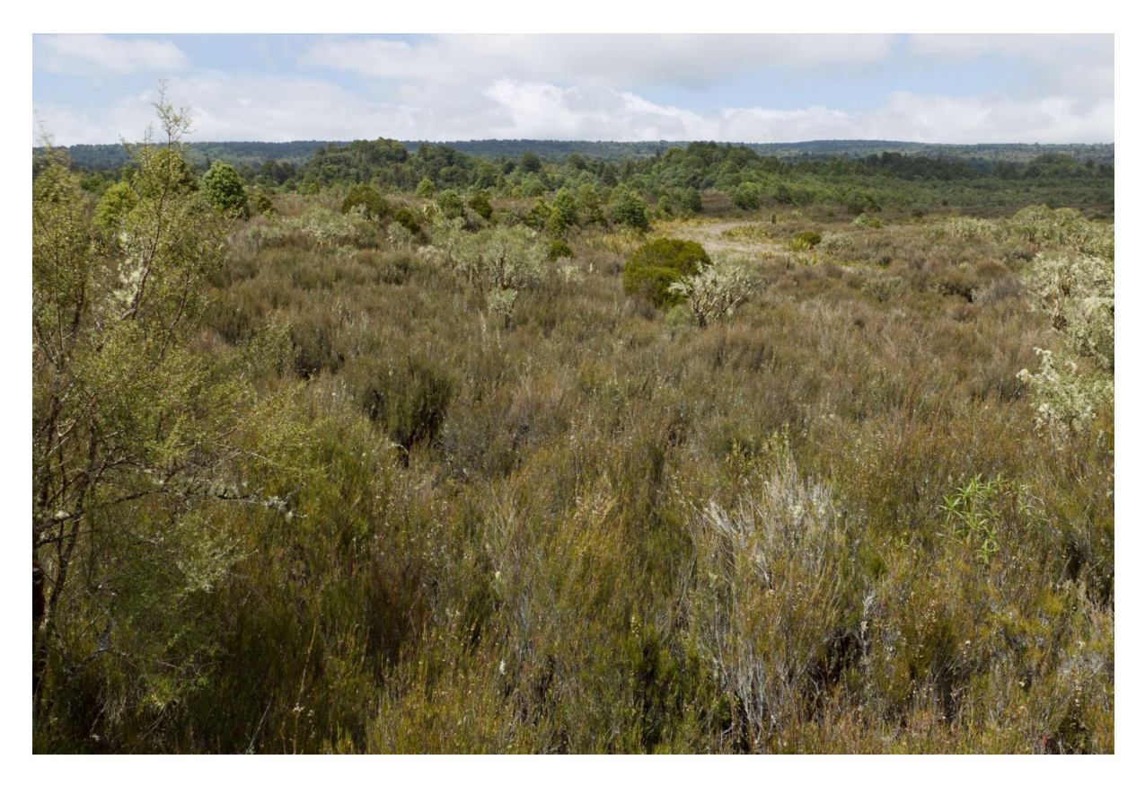
Figure 1 : Monoao scrub on frost flat heathland on the Whenuakura Plain, Pureora Forest Park. Short conifer (mountain toatoa) forest in the background. At 790 m asl, this is highest-elevation frost flat on the Volcanic Plateau. May 2013.

The long-term persistence of non-forest communities on well-drained sites under reasonable rainfall is unusual in New Zealand, and frost flats provide habitat for a suite of species that would otherwise be absent from these landscapes. As a historically rare ecosystem, frost flat heathland falls within National Priority 3 ('To protect indigenous vegetation associated with 'originally rare' terrestrial ecosystem types') of the National Biodiversity Strategy (MfE/DOC 2007) and is now a Critically Endangered ecosystem (Holdaway et al. 2012).