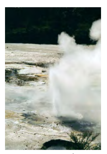
Figure 9-14: OKF0760/1 erupting in 2004.

History: OKF0760 spring has had alternating periods of dormancy and flowing activities lasting several years (Lloyd, 1972).