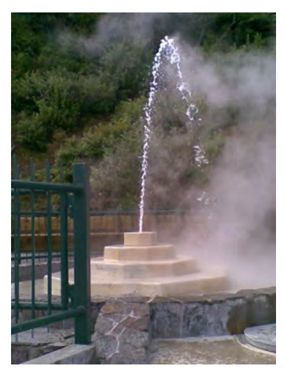
Figure 13-1: Mokena Geyser erupting to ~1.5 m high in

Threats: Hardly threatened. This is an artificial feature with values for its tourism uses, so its activity is likely to be maintained by the owner.