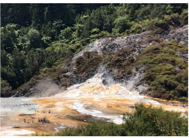
Figure 9-17: Pyramid of Geyser on February 2020.

Description: Two intermittently active geysers with massive creamy, white sinters that cascade down the slope. The vent of S812 is about 1.5 m in diameter and about 2 m up from the terrace level. Since Waikato Regional Council monitoring began in 1995 the geyser has exhibited periods