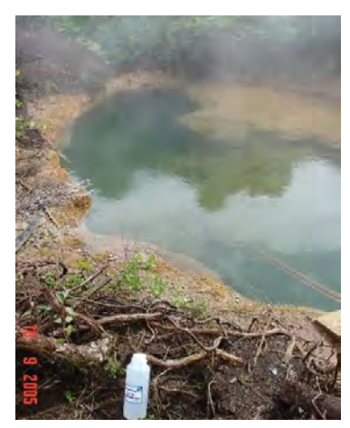
Figure 15-2: Tuwhare Spring in 2005.

Description: A hot, clear spring about 6 m long and with a maximum width of 2 m. It is surrounded by a flat sinter apron at the south-east end of the marae grounds, which is across the road from the public baths. It is about 30 m north from the roadside and surrounded by a high fence covered in Japanese honeysuckle.