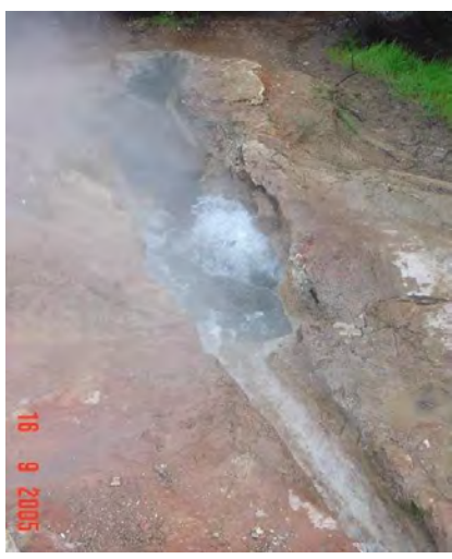
Figure 15-3: Taumatapuhipuhi Geyser in 2005.

Threats: Severely threatened. Taumatapuhipuhi is vulnerable to increased well draw off