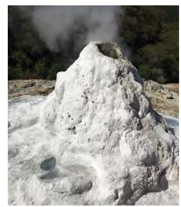
Figure 19-3: Lady Knox Geyser on February 2020.

Threats: Moderately threatened. Continued soaping affects the cone structure and composition. The feature and its sinter surrounds are easily accessed by the public.