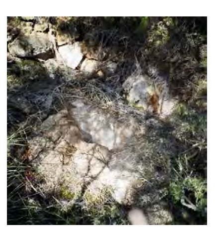
Figure 9-3: Bush geyser in 2004.

Type: An active geyser depositing silica to form sinter.