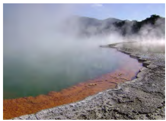
Figure 19-1: Champagne Pool in 2019.

Location: NZMS-260 U16: 2804468 E, 6310529 N. Location measured from GPS (+/- 15 m).