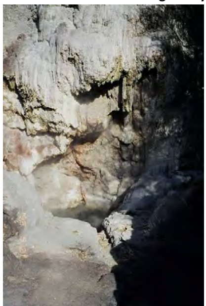
Figure 9-10: Dreadnought geyser in 2004.

Type: An active geyser depositing silica to form sinter.