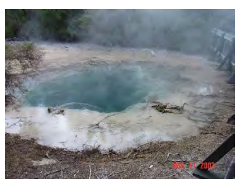
Figure 15-5: One of the three Hoani Springs in 2004.

Type: Three near-boiling springs actively depositing silica to form sinter.