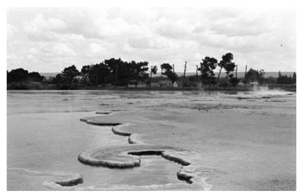
Figure 8-1: Ohaaki Pool before it was affected by extraction.

If the channelled outflow were blocked and the overflow dispersed, sinter accumulation would resume across the terraces. The pool is within the Ohaaki