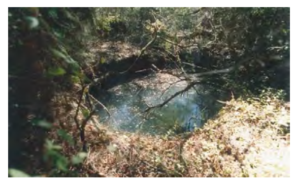
Figure 15-1: Te Korokoro A Te Poinga in 2000.

Description: A hot, clear spring about 2 m in diameter, found in the bush downstream of the Tokaanu domain, close to the Atakorereke Stream. The spring has sinter