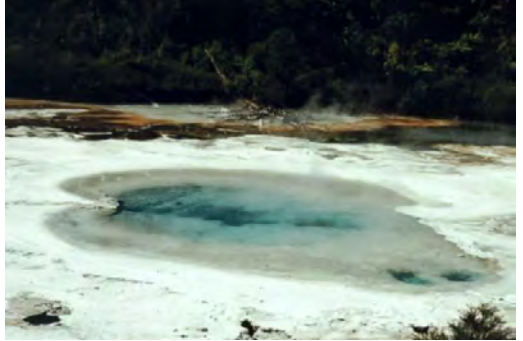
Figure 9-16: OKF0806 in 2004.

Description: An active geyser with flaky, grey laminated sinters and surrounds. The vent is about 0.5 m in diameter in a shallow depression on the east side of a rotting old pine tree. Since