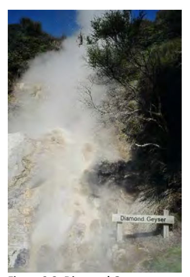
Figure 9-2: Diamond Geyser Erupting in 2004.

Description: An active geyser, which during the years 1995 to 2005 was observed by Ashley Cody to erupt 3 to 8 m high in pulsating jets for several hours, with approximately 1 L/s overflow. The frequency and duration of eruptions were less before Lake Ohakuri was formed. However, no eruptions were witnessed during 2007 and April 2008. During this time, only a trickle of water constantly flowed over the vent rim and down the slopes of the geyser mound. The vent is approximately 1 m in diameter, and about 3 m above the level