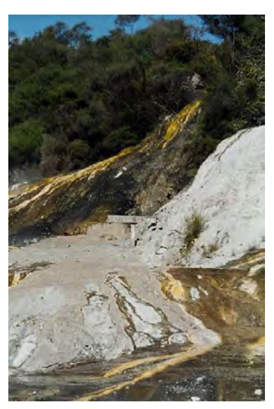
Figure 9-5: Sapphire geyser in 2004.

Type: An active geyser depositing silica to form sinter.