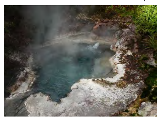
Figure 9-6: My Lady's Lace with a high water level.

down the scarp of Rainbow Fault above S108-110. It boils for several days or weeks at a time, then stops boiling and the vent basin dries out for a period of time. On December 5<sup>th</sup> 2007 the pool drained overnight and had not refilled by April 25<sup>th</sup> 2008. The vent is a basin about 2.5 m in diameter surrounded by manuka scrub. There appears to be a sympathetic action with Diamond Geyser (described above), as data-logger records show that S111's boiling episodes frequently occur at the same time as eruptions from Diamond Geyser (Cody, 1996).