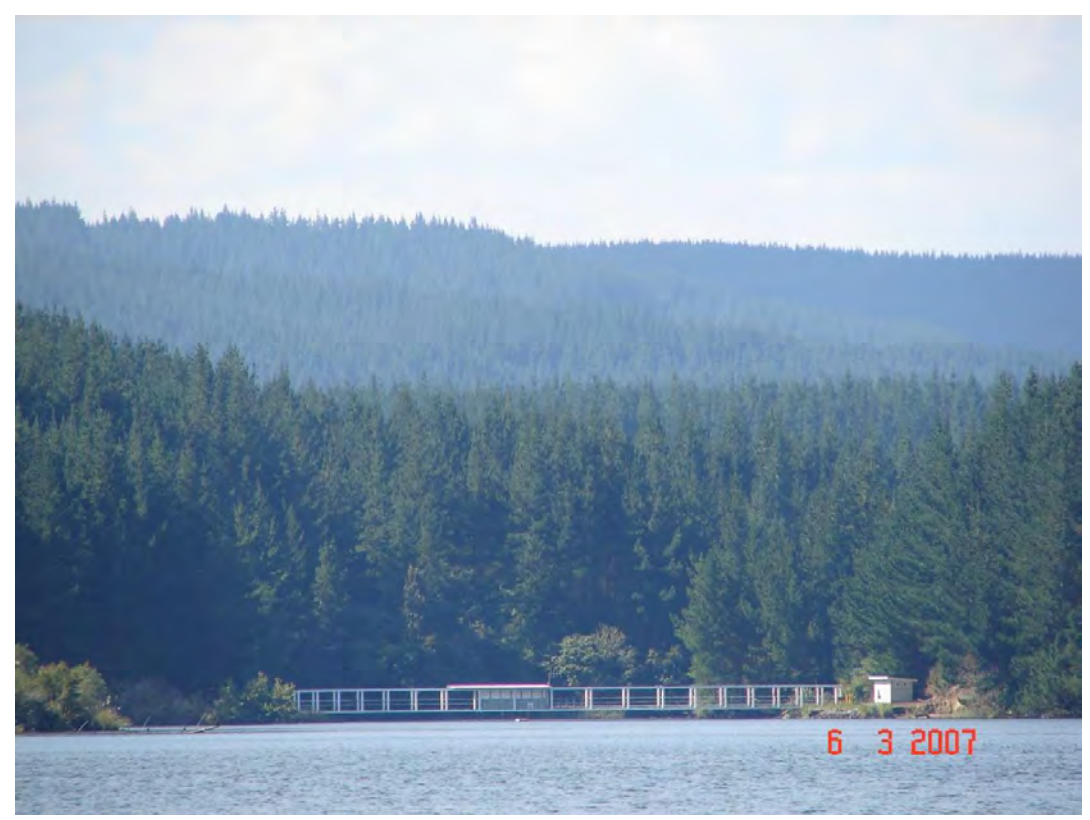
Figure 5-1: Sinter springs discharge on the bed of Lake Maraetai