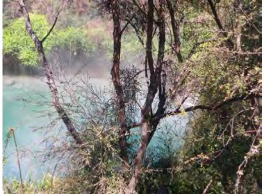
Figure 3-3: Northern Pool, Whangapoa

The pool fills a crater which may have been of hydrothermal eruption origin. Geothermal ferns inhabit the steep sides of the crater.