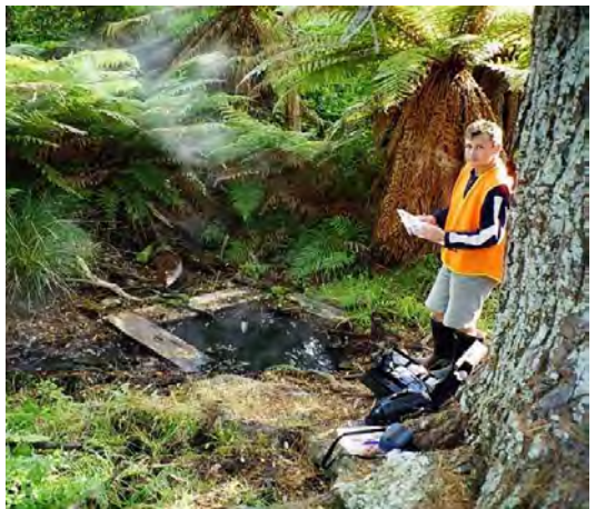
Figure 4-2: Gully spring