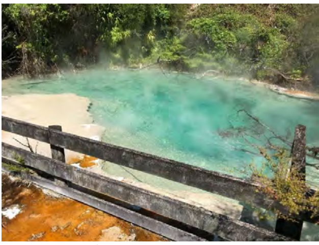
Figure 9-1: Map of Australia on 11 February 2020. Copyright Jesse Ledwin Lebe.

Description: This is a clear, alkaline flowing spring approximately 9 m long x 4 m wide. It is situated at the western end of the car park, and its flow supplies a bathing pool. It has thick