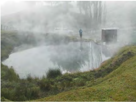
Figure 4-1: Waipupumahana

Description: This is the largest active feature remaining in Horohoro. It is a circular pool about 12 m in diameter with vertical sinter walls on the eastern half of its circumference. It has clear, blue water with a temperature around 50 °C, no odour, and occasional bubble swarms, most likely caused by evolution of CO_2 . Since Waikato Regional Council started monitoring the spring in 1995, the water temperature has ranged between 48 and 56 °C. The outflow is about 0.5 to 1.0 \, l \, s^{-1} .