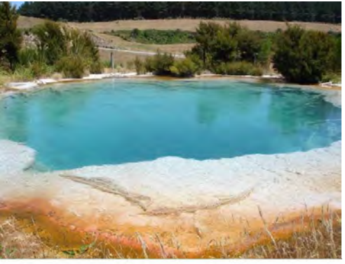
Figure 3-2: Southern Spring, Whangapoa

Location: NZMS-260 U16: 277605 E, 6311078 N +/- 5 m. Location measured from GPS (+/- 5 m).