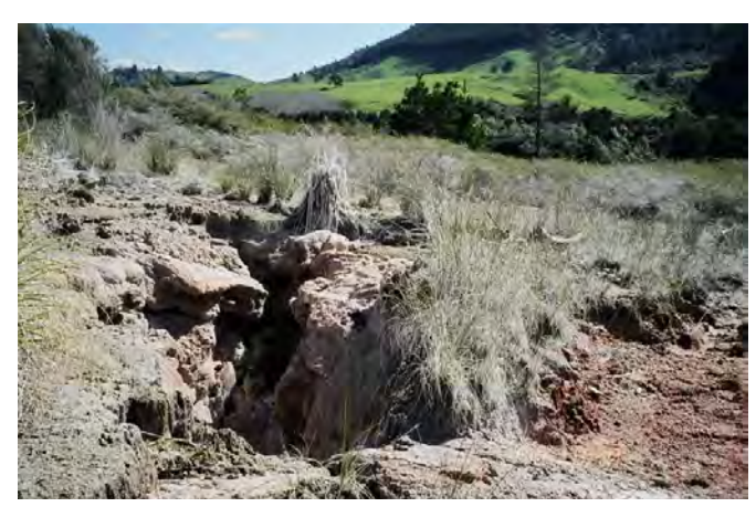
Figure 9-12: Dry Kurapai Geyser in 2004.

Location: In scrub and bush about 250 m west of Artist's Palette terrace. NZMS-260 U17: 2784662 E, 6298404 N. Location measured by GPS, +/- 15 m.