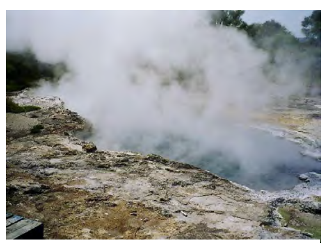
Figure 10-1: Māori Spring in 2004.

Threats: Moderately threatened. If the Reporoa geothermal system classification were changed to Development, the spring would be highly vulnerable to any geothermal well production reducing aquifer pressure and stopping all flows. It is also at risk from any human activities such as diversion of outflow into a narrow channel, which would stop sinter formation.