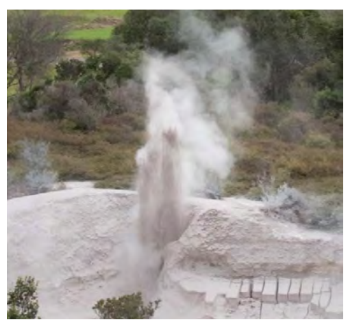
Figure 14-1: Te Kopia Mud Geyser erupting in 2009.

Description: This geyser is possibly unique in that its discharge is muddy water, erupted from a narrow vent in the side of a large mud pool. Since Waikato Regional Council started monitoring the geyser in 1995, it has exhibited three types of activities. It has periods of dormancy, interspersed with infrequent large eruptions that may take place only every few months. These eruptions coat the surrounding vegetation with mud. The geyser also has periods in which it has smaller, more frequent eruptions, ejecting a column of grey, muddy water 3 to 10 m high as a