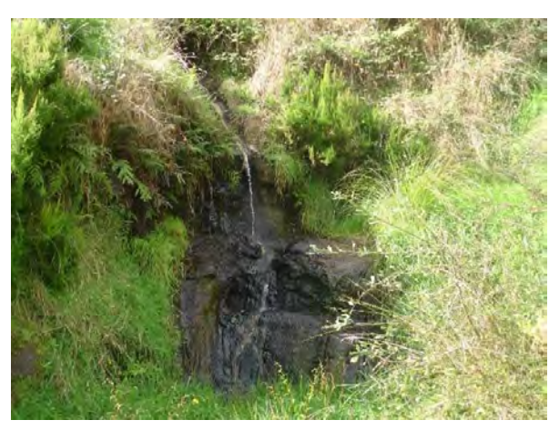
Figure 3-1: Matapan Rd Spring

In an arm of Lake Atiamuri about 0.5 km west of the two main hot springs there is a small hot spring, which was flooded by the filling of the lake in January 1961. This was a silica-forming