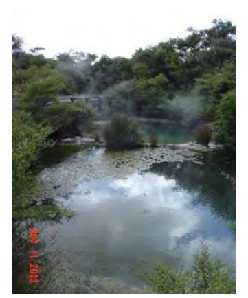
Figure 15-6: Te Paenga Springs in 2004.

Location: (Takarea) NZMS-260 T19: 2749460 E, 6244725 N – (Te Paenga) NZMS-260 T19: 2749449 E, 6244723 N. Location measured from GPS (+/- 50 m).