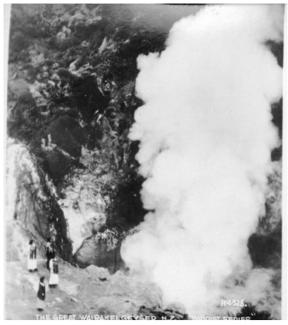
Figure 20-1: Great Wairakei Geyser in 1929.

Many geysers were present in Geyser Valley. Gregg and Laing (1951) described 270 flowing springs in Geyser Valley, of which 132 were neutral to alkaline; and of these 30 were true geysers. These had all ceased flowing by 1965 as a result of the operation of the Wairakei Power Station, which started production in 1958. By 1966 discharge of chloride water from Geyser Valley had virtually ceased (Glover, 2000).