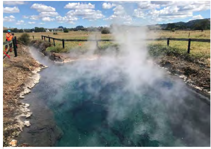
History: No Māori name or legend known.

Description: A large, circular hot spring about 8 m in diameter with clear, calm alkaline water. In 1999, a channel was dug to contain the outflow of about 1 L/s. In clear sunlight the view down the vent shows vertical overhanging walls to a depth of more than 6 m. There is no present silica deposition in the surrounding area due to the outflow being directed into an artificial channel.