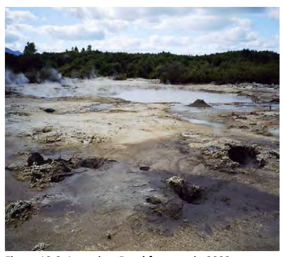
Figure 10-3: Longview Road features in 2003.

Type: Three or more hot springs no longer depositing silica.