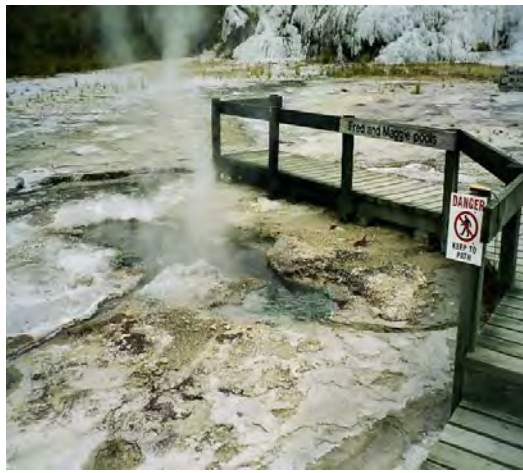
Figure 9-7: Fred and Maggie pools in 2003.

Description: The basin is about 2 m in diameter, and irregular in shape. From the mid-1990s to 2008 the temperature of the pool has been constant around 98 °C with a flow of approximately 0.1 L/s. Smooth, massive sinters coat the walls and the outflow channel. Discharge from the springs deposit silica and contribute to build up of the sinter terrace.