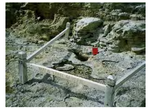
Figure 19-2: Waiotapu Geyser in 2004.

Location: NZMS-260 U16: 2804491 E, 6310255 N. Location measured from GPS (+/- 50 m).