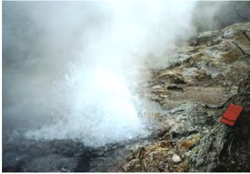
Figure 19-7: Hakareteke Geyser in 2004.

Location: NZMS-260 U16: 2805525 E, 6313309 N. Location measured from GPS (+/- 50 m).