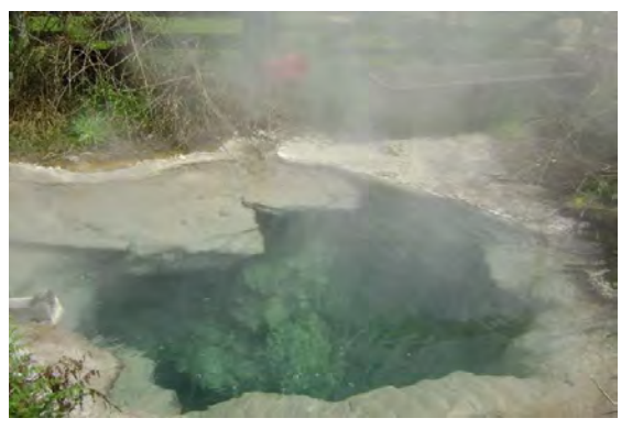
Figure 18-2: Scalding Spring in 2009.

Location: NZMS-260 U16: 2799917 E, 6315382 N. Location measured from GPS (+/- 50 m).