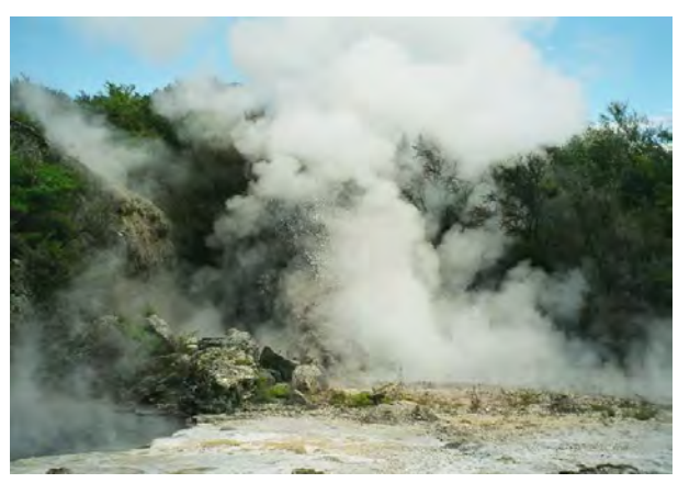
Figure 9-11: Wairiri Geyser erupting in 2004.

Description: This feature had a period of eruptive activity from November 1982 to June 1983 (Cody, 2002c). It also erupted in 1996. In September 2002 it resumed overflowing, and then began erupting approximately seven times per day for 17 minutes at a time. Eruptions consisted of multiple spurts 5 to 8 m high in all directions and lasted for about 8 minutes, producing a flow of approximately 10 L/s (A.D.Cody, emails to Katherine Luketina, 19/11/2002 and 5/12/2002). This lasted until early 2003, when it