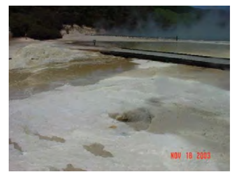
Figure 19-4: Jean Batten Geyser in 2004.

Description: It has not been known to geyser since there was a sinter collapse that formed a new hole 5 m to the north-east (WTF2069, "Pool N of Jean Batten Geyser") in 1994 (Cody, 1996), and does not overflow, although there is boiling in its pool. The water level is about 2 m below the ground surface. It used to erupt for approximately a minute to a height of 5 m (Cody, 2000).