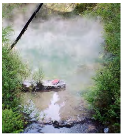
Figure 19-5: Venus Bath in 2004.