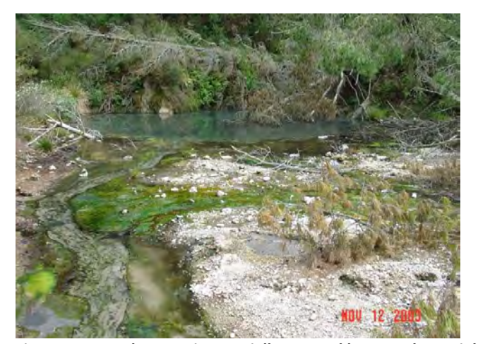
mats and pumiceous debris

History: No name, use, or legend Figure 7-1: Southern Spring partially covered by cyanobacterial known.