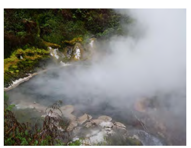
Figure 18-3: Te Manaroa Spring with travertine in 2013.

Type: A boiling spring actively depositing calcite to form travertine.