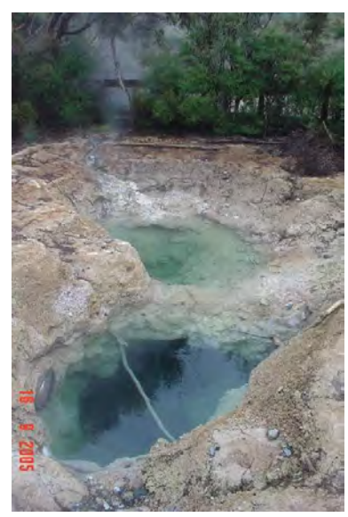
Figure 15-4: Matewai Spring in 2005.

Description: Matewai spring has sinter walls and surfaces. The water is steadily convecting, with occasional bubble plumes. Silica deposits as highly porous, coral-like masses.