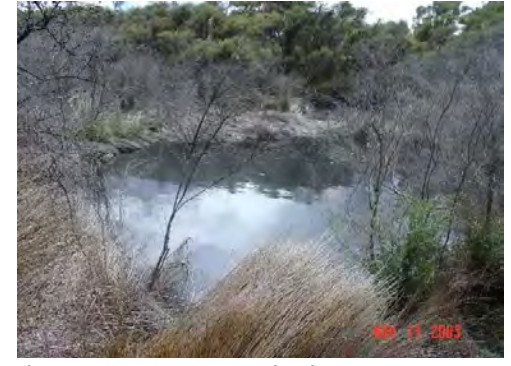
Figure 15-7: Teretere Spring in 2004.

However, on Friday 23 and Saturday 24 November 2001, the pool erupted repeatedly and boiling overflows flooded surrounding manuka shrubs,