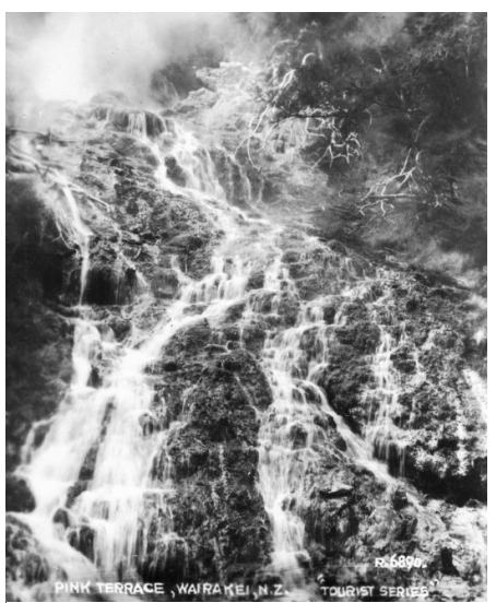
Figure 20-2: Pink Terrace, Wairakei, in 1929.

Keam (1961) also describes the Devil's Inkpot [WKF217], "which plays every two minutes" and Satan's Toll-gate [WKF180] and a smaller adjacent springs which "occasionally splash across the path and bar the way – hence the name". In the same publication Keam also mentions Satan's Punchbowl [WKF185], ("actively terrace building"), Crystal Pool [WKF186], the Indicator, and the Menagerie.