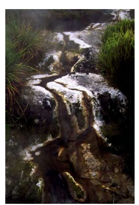
Figure 7-2: Outlet from Calcite Spring in 1995.

Description: This spring is situated on the west bank approximately 10 m from the Orakonui Stream. It had its genesis sometime between 1986 when Glover visited the area (Glover 1986) and 1995 when Waikato Regional Council started monitoring the Ngatamariki Springs. It was a neutral, hot (approximately 85 °C), clear and calm spring approximately 1.5 m in diameter. It had 10 to 50