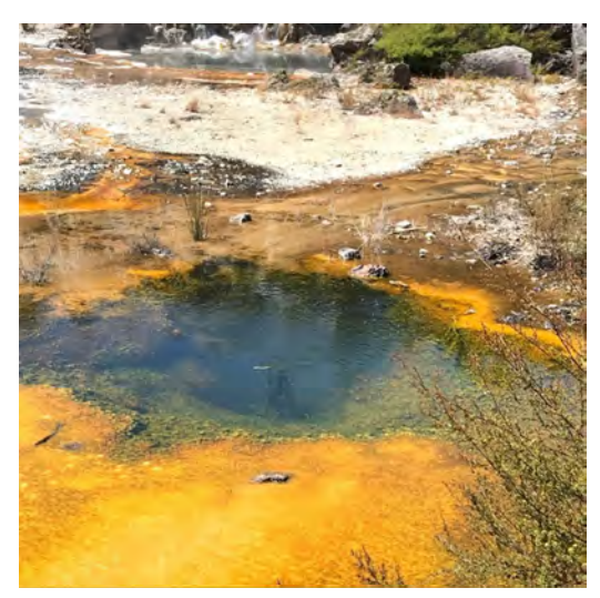
Figure 9-8: An overflown Manganese Pool with visible conophyton stromatolite growths in February 2020.