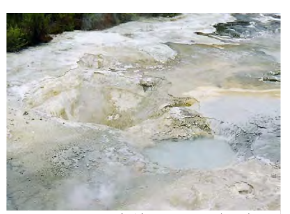
Figure 9-15: OKF0774 (left) and OKF0773 (right) in 2003.

Condition: Recoverable. Altered by river level increase.