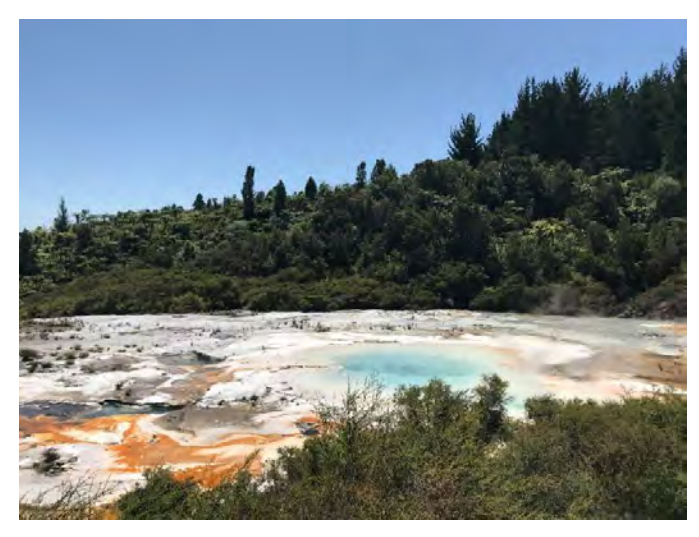
Description: An active pool Figure 9-13: An overflowing Palette Pool on February 2020.

gevser with hard white sinters and surrounds. The geyser plays 1