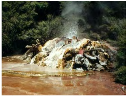
Figure 15-8: Healy's Bore No.2 in 2004.

Description: A well was drilled in 1942 and left open to discharge at the surface. It was capped at least once but the cap eventually corroded. Most of the time since 1942 it has discharged at